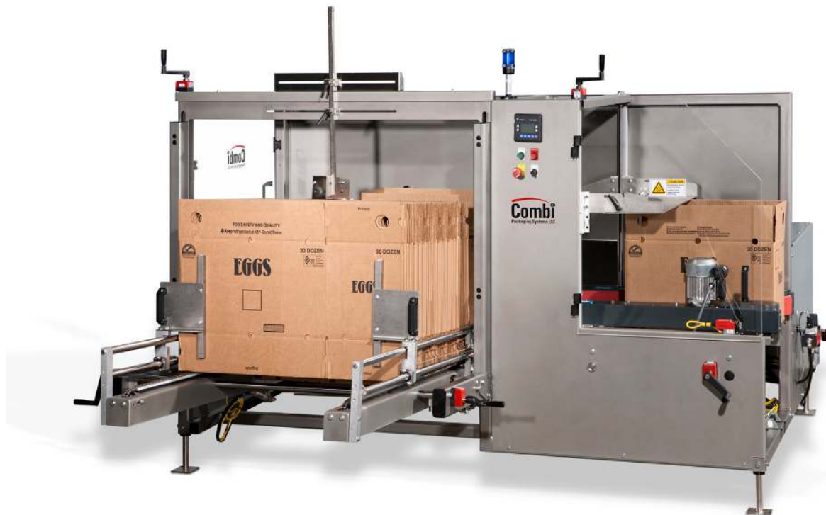
2-EZ ® XL for Large Cases