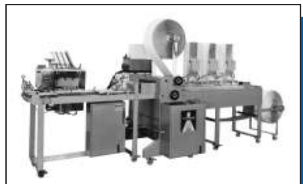
Purchase of some options may change specifications and requirements